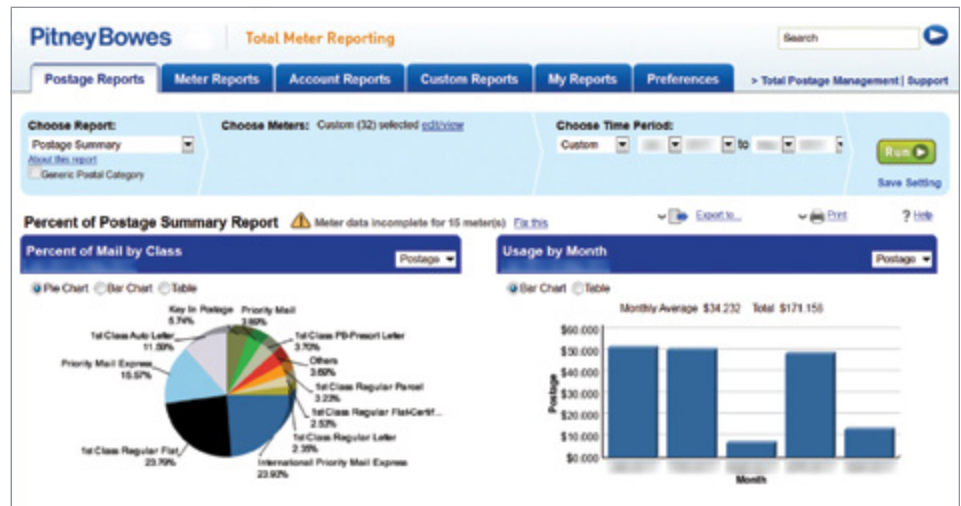
Total Meter Reporting