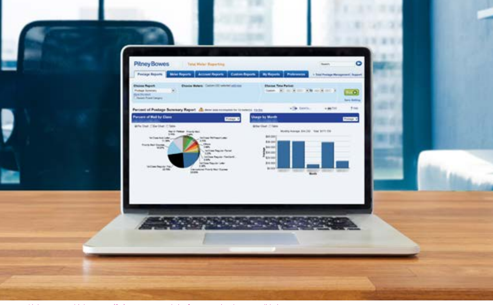
Link one or multiple meters (2+) to a secure website for enterprise data consolidation.

INVIEW™ Analytics: The power to manage and control costs With all the documents and packages flowing in and out of your offices, it can be a monumental undertaking to collect, track and manage cost information.