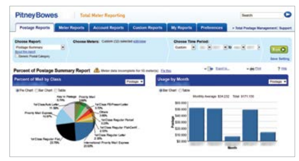
Total Meter Reporting